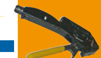
M50389 Multi-Lok Hand Tool Adjustable tension, forms lock, cuts off tail.