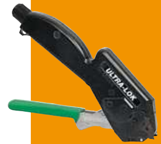
A94079 Ultra-Lok® Tool Adjustable tension, forms lock, cuts off tail.