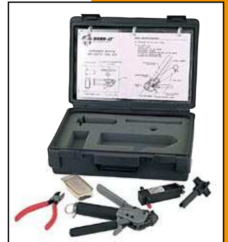
A49099 Tie-Dex® II Kit

Weight: 4.6 Lbs (2.0 Kg). Kit includes: 1-A30199, 1-A47599, 1-A44699, parts and cutters.