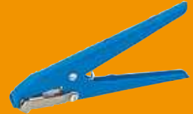
AE2009 Cable Tie Tensioner