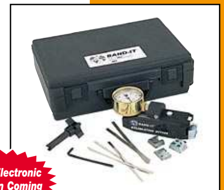
A50099 Tie-Dex® Calibration Kit

50 test bands. Weight: 0.1 Lbs (0.06 Kg).