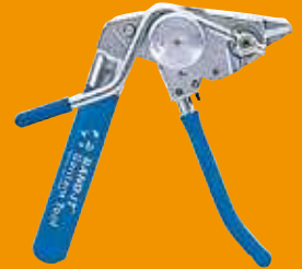
C07569 Bantam Tool