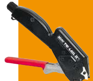
A91079 Mini Tie-Lok® II Tool Adjustable tension, forms lock, cuts off tail.