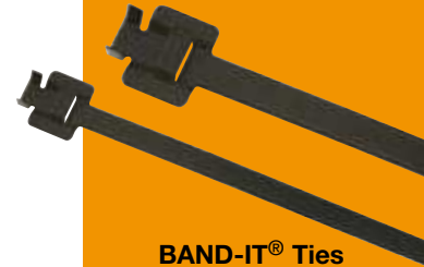
BAND-IT® Ties PPA571 coated

Material thickness includes PPA coating - Base material thicknesses uncoated: 1/4" is 0.015"; 3/8" is 0.015". Low smoke, non-toxic, zero halogen, PPA coated with superior corrosion resistance.