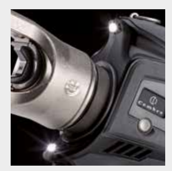
LED lighting of the working area

Anatomically shaped grip for improved comfort