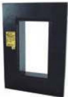
SF 6x1 W Ex primed EXSFF6000000112

Telai SF...W Ex, in acciaio con prima mano d'antiruggine » SF...W Ex Rahmen, Baustahl geprimert » Marcos SF...W Ex en acero dulce imprimado » Cadres SF...W Ex, acier doux peint