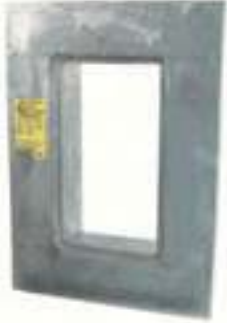
SF 6x1 W Ex AISI 316 EXSFF6000000121

Telaio SF...W Ex, in acciaio inox resistente agli acidi » SF...W Ex Rahmen, säurefester, rostfreier Edelstahl » Marcos SF...W Ex en acero inoxidable a prueba de ácidos » Cadres SF...W Ex, acier inox resistant aux acides