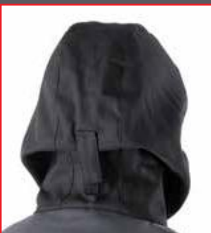
Adjustment system on the back of the hood.

A back length of 121 cm to ensure an efficient protection of the operator until the knees.