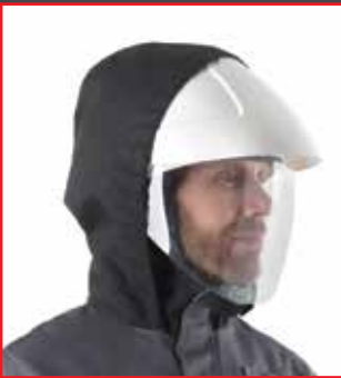
Hood with helmet.

An adjustable hood for a better protection of the head and the neck in case of a higher risk, to be wear with a visor or a helmet.