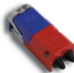
Low Force Lever Release model

An armour bond kit is available, comprising: - clamp, ferrules, lead-strips and fixing screws. Suitable for loop in/out cables.