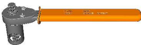
'JTS/7I' Universal Screw Ratchet Tool (Insulated)

The appropriate tooling is to be used at all times, typical examples shown below.