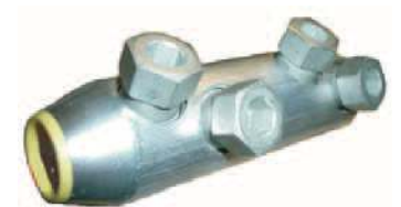
SPS Joint has tapered Profile with Conductors Centralised

Notes: Items 1-3 are the Universal type, items 4-12 have only the required modules. Trifurcating Joints are available.