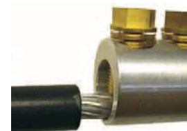
Non Centralised Type Connectors