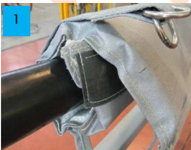
1 POSITION THE COVER AT THE CENTER OF THE JOINT