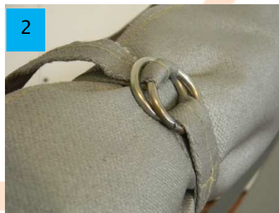
2 WRAP THE COVER AROUND THE JOINT