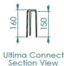
ULTIMA Connect cross-section detail