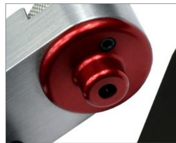
Recessed steel blade makes tool safe to carry & store.