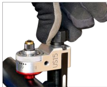
Knobs are engineered with knurls & grooves for easy adjustment when wearing gloves