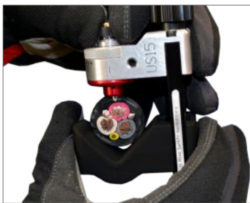
Quick-adjust jaw accepts hard & soft insulated cables ranging from 0.39" to 1.96" (10 mm to 50 mm).