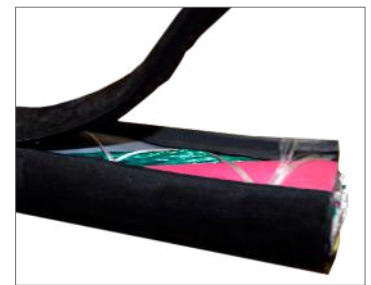
Quickly & easily performs ring, spiral & longitudinal cuts.